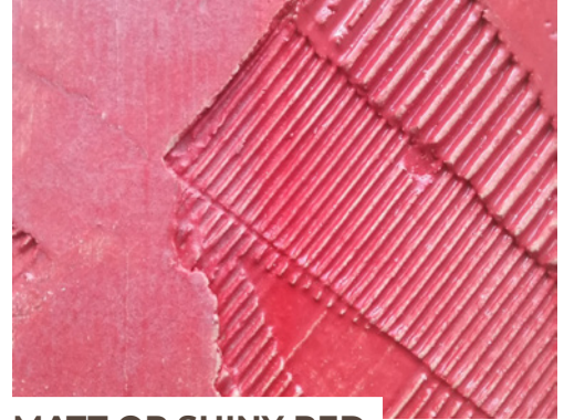
MATT OR SHINY RED