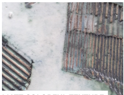
MATT COLORFUL TEXTURE